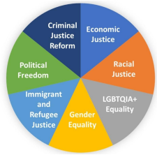
Table. This was our first community-wide discussion of perspectives and recommendations on how we come together around anti-racism/anti-oppression as one of our Vision 20/50 priority areas. A special thanks to the organizing team, facilitators, note-takers, and IT wizards who made this an accessible and welcoming space to begin this conversation.

Here are summaries of the event evaluation, small group discussions, and all UAAA group efforts focusing on anti-racism and anti-oppression. They are rich with great ideas and opportunities to engage!