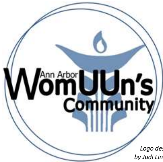
Logo design by Judi Lintott