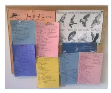
"Bird Corner" has this season's list of birds seen on the UUAA property.

She is often asked about plantings and food sources that draw specific birds. The Eastern bluebird feeds on berry-producing shrubs but also eats raisins and meal-worms. Many birds, like scarlet tanagers, Baltimore orioles, and Northern flickers, feast on berries (black-, blue-, service-, and elder-berries) and dogwood. Carolina wrens love all things "peanutty" like raw peanuts or peanut suet cakes. The gray cathird also enjoys berries along with holly, hawthorn, and bayberry. The pileated