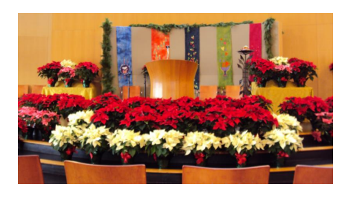
Poinsettia Purchase Read about how to join in the holiday festivities.

Intro to Our Faith <u>Register to join our</u> <u>course on Unitarian</u> <u>Universalism.</u>