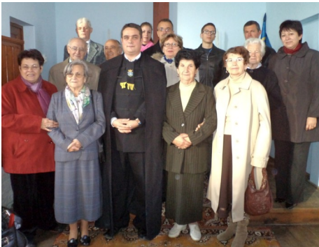
Our Partner Church congregation

For further information or to become involved in this program, contact: